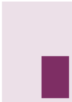
Quarter page 90mmx130mm