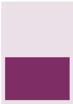
Half page 190mmx130mm